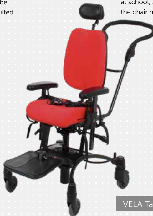
VELA Tango 100S

VELA Tango 100S with a push handle is suitable for children who use the chair in different places, for example at school, and require support when the chair has to be moved.