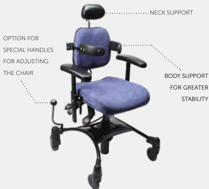
Examples of accessories for VELA Tango 100S

A complete list of accessories is available at www.vela.eu .