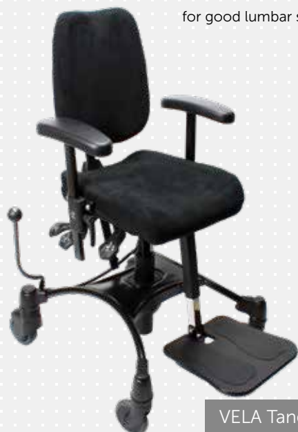
VELA Tango 100S

VELA Tango 100S is supplied as standard with a seat featuring a cavity with foam panels that can be reversed or changed, optimising sitting support for the child. The backrest is height adjustable and can be moved forwards and backwards and tilted for good lumbar support.